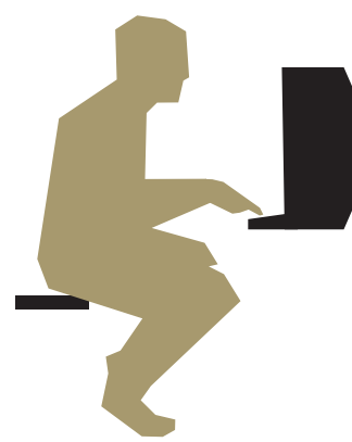
WEB OF COMMUNICATION EMPOWERMENT

WEB 2.0 UGC/VIDEOS WEBLOG INTERACTIVE OOH INSTANT MESSAGING CROWDSOURCING PODCAST SOCIAL NETWORKS WIKI VIRALS SOCIAL COMMERCE AUCTIONS WIDGETS