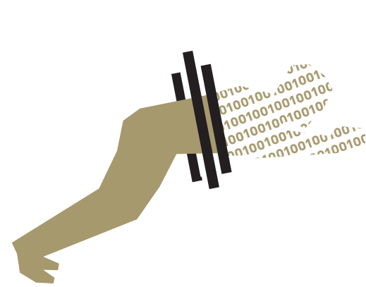
WEB OF CONTEXT IMMERSION

WEB 3D CINEMATIC GAMES SEMANTIC WEB HOLO ENTERTAINMENT 3D CHAT SMART SEARCH HOLO TV & GAMING VIRTUAL WORLDS SMART AV EXPLORATION MMORPG VIRTUAL SHOPPING SMART ADVERTISING CONSOLE GAMING GESTURE CONTROL